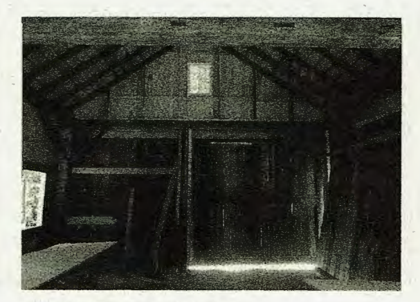
Blacksmith Shop Interior