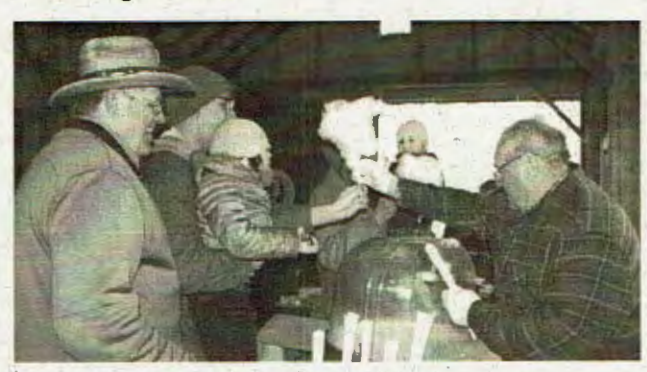
Oh Yum! That Maple Cotton Candy