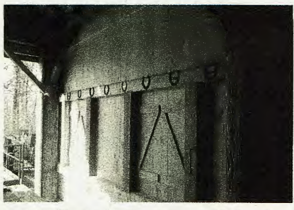
Help the Blacksmith Shop – For a $100 donation you can have a horseshoe on the wall bearing your name.