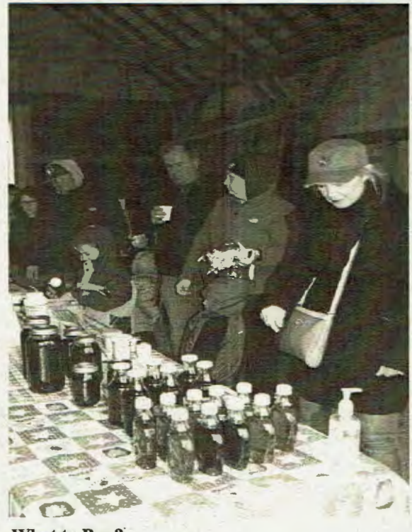
What to Buy?