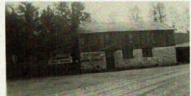
The Old Frontier Inn

The property included 60 acres, a stable and a scattering of rental cabins. Except for an interruption in World War II when Walter went to work for A. O. Smith in Milwaukee, they ran the Alpine Retreat until 1970.