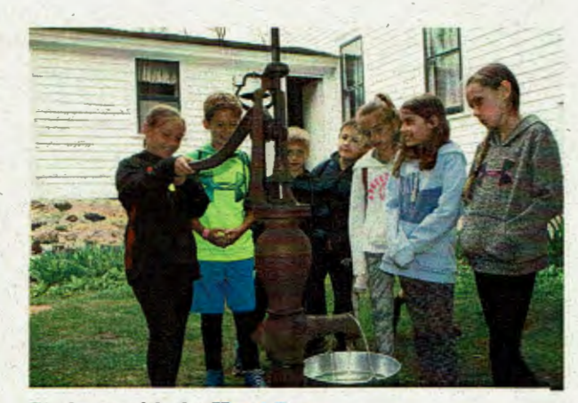
Students with the Hand Pump