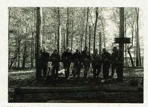
The Blacksmith Shop Crew