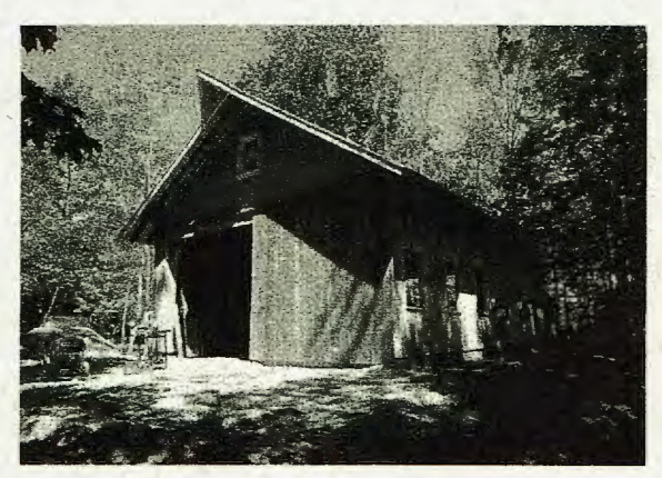
Blacksmith Shop Exterior

Our society's future is bright partly because of the wonderful Park we manage but more because of our membership. It wasn't that long ago that I hadn't even heard of the Richfield Historical Society. It was due to a chance meeting with a neighbor that started me down the path to where I find myself today. I would encourage everyone to speak with friends and neighbors about our society. Somewhere out there could be a future president of our society who just doesn't know it yet. . . . . . . . I'm thankful for the opportunity to serve.