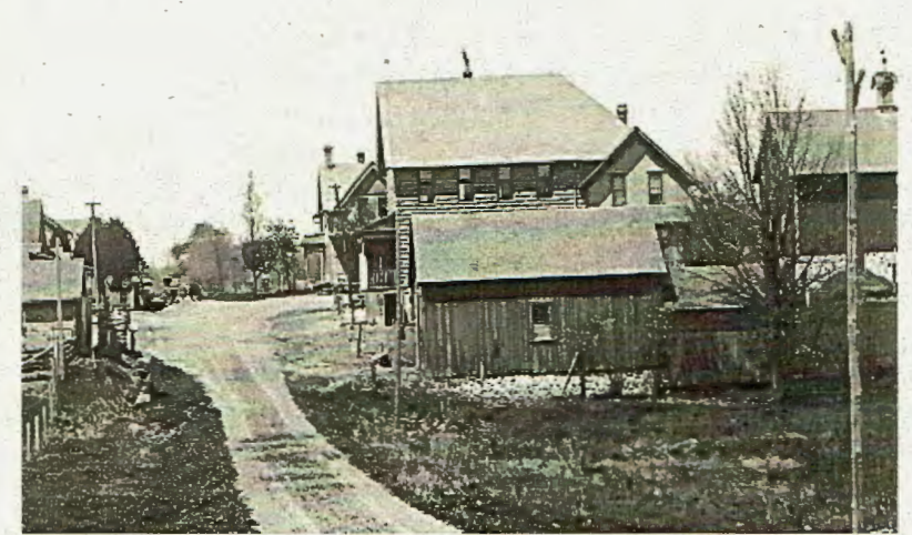
One of the two blacksmith shops located at the Pleasant Hill Crossroads (right foreground)

Each old-time blacksmith shop had an atmosphere of its own which reflected the personality of the smith and character of the community. The village blacksmith was an ingenious fellow in possession of muscle. Blacksmith shops, until the end of WW II, had so long been part of every community that they were more than a necessity. They were a solid link with the past.