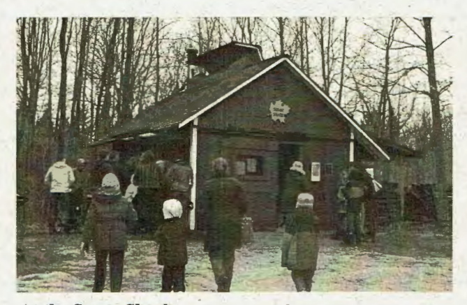
At the Sugar Shack

If you missed Maple Syrup Family Day this year, there is always next year. Mark your calendar to visit the RHS website around the first of the year for specific details (<a href="www.richfieldhistoricalsociety.org">www.richfieldhistoricalsociety.org</a>). It is a wonderful family event and the maple syrup demonstrations are free to everyone.