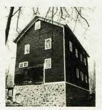
Mill South Wall

Next will be the building of the engine shed, the placement of the Superior gas engine and the refurbishing of the line shaft assembly to "Get It Grinding."